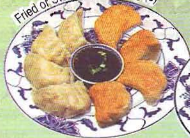
Fried or Steamed Dumpling (8)