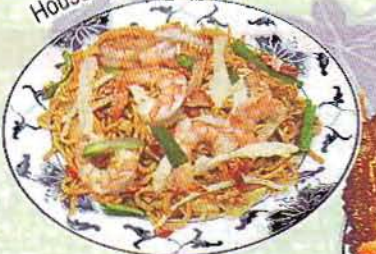
House Special Lo Mein