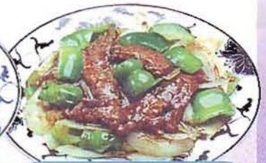
Pepper Steak w. Onion