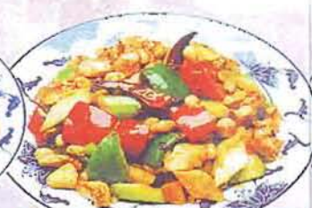
Kung Po Chicken