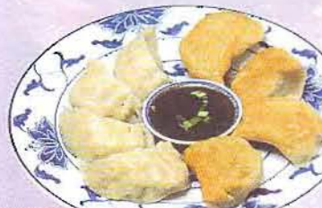
Steamed or Pan Dumplings