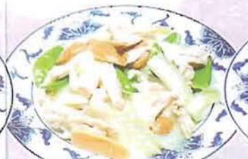
Moo Goo Gai Pan