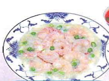
Shrimp w. Lobster Sauce