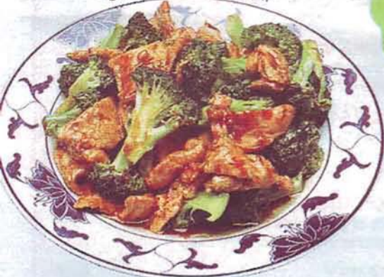
Chicken w. Broccoli